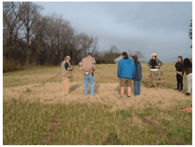
Tree Hill Farm area, site of recent DHR field school