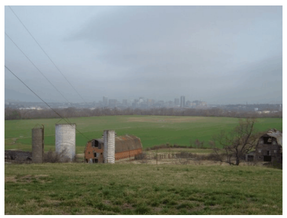
Tree Hill Farm area, site of recent DHR field school

Summary: Excavation of the Golden Ball Tavern in downtown Petersburg will enter a third year this season. The location of a Late Woodland Native American occupation, it was later the site of the 18th/19th century Golden Ball Tavern. While the foundation of the tavern has been studied previously, the back yard will be examined. It is anticipated that this area will be replete with the garbage of the day which will document foodways, tavern fair, and local activities. The site meets the criteria for the Certification Program.